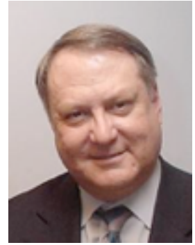
by George Kane

Well, the protections between the separation of church and state were designed to protect people of faith from government, not government from people of faith. This is a country that in our founding documents says we're a nation that's founded under God, and the privileges and blessings at that we have are from our creator. They're