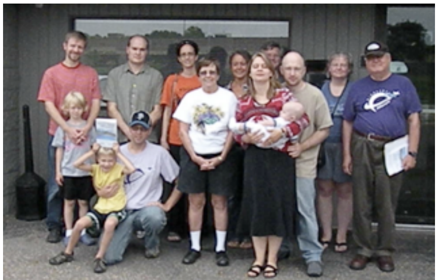
Right: Radio show producers, Atheist Voices contributors, and assorted family members pose for a photo following the August 26th episode.