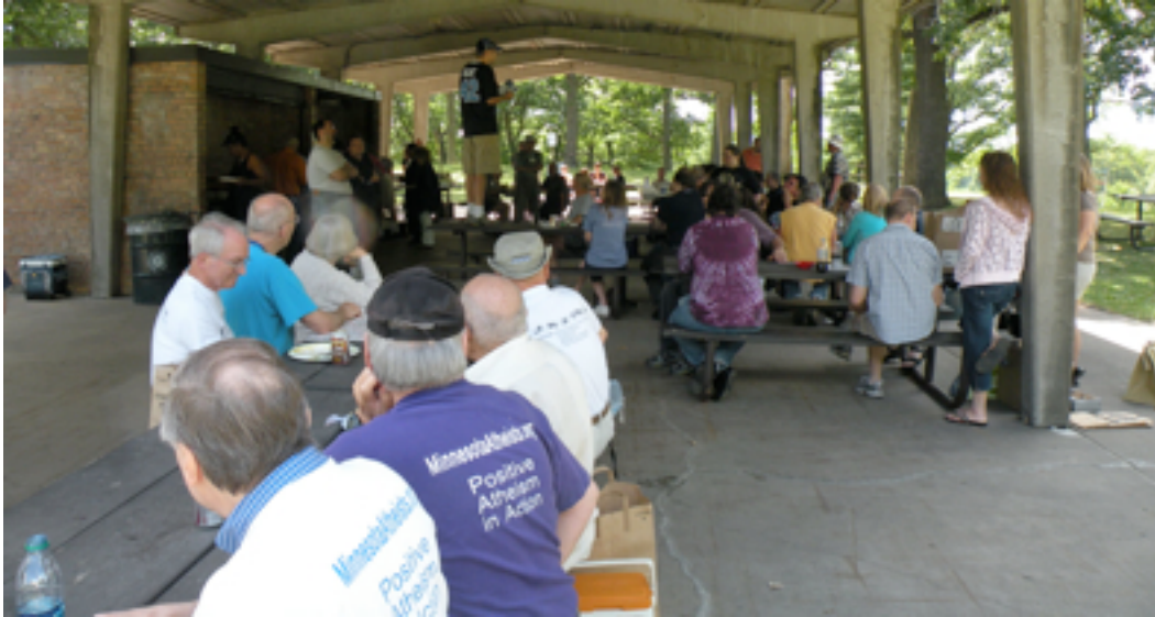
Above: On August 18th, Minnesota Atheists enjoyed the last Freethinkers' Picnic of the summer (above).

“If Jesus had been killed 20 years ago, Catholic school children would be wearing little Electric Chairs around their necks instead of crosses.”