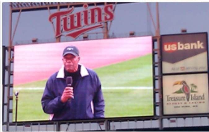
Above: Rod Carew speaks on behalf of Light the Night.